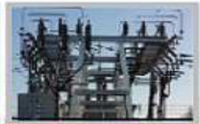
Powerstation & Substation