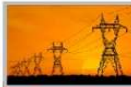
Transmission & Distribution